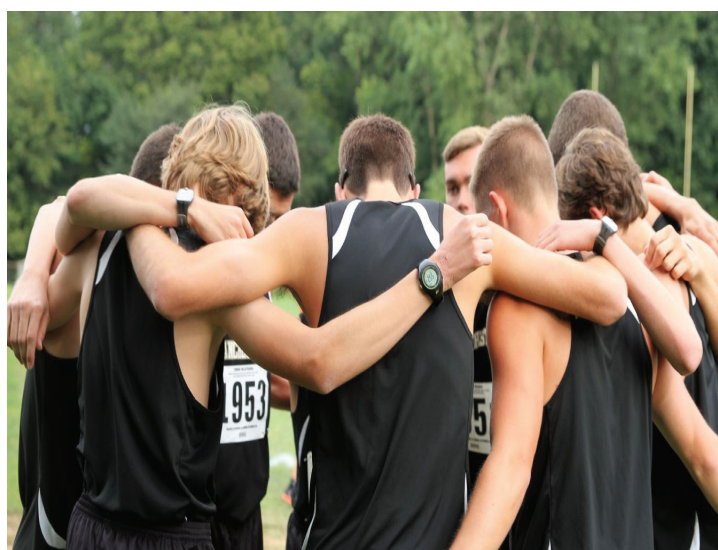
The men’s cross-country team huddles during Hokum Karem.